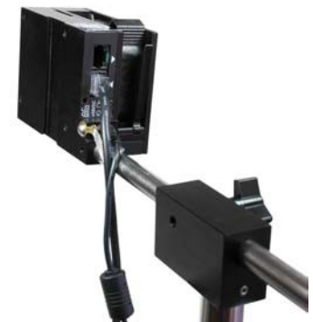
Printhead Module with Bracketry