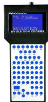
EVOLUTION II Hand Held Controller

Complete PC control of the EVOLUTION II network through our EVOLUTION-NET software is available as an option.