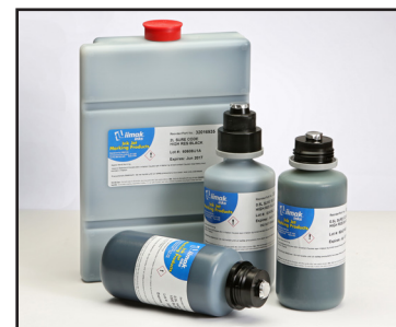
OEM Compatible High Resolution Inks for Diagraph, Foxjet, Domino, and more.