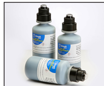
NEW!! Sure Scan II Replacement pigmented ink for Trident ScanTrue II used in Foxjet & Diagraph.