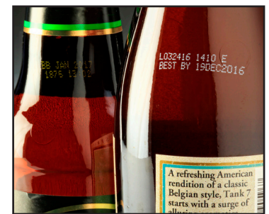
Ideal for a range of primary coding applications.