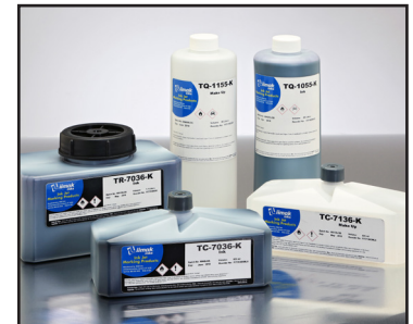
OEM compatible CIJ inks for Domino, Videojet, Linx, and more.